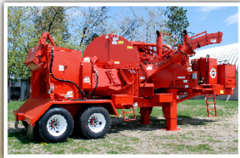
MODEL 30 NCL

Produce clean chips by positioning an NCL behind a stand-alone debarker or feed with an auxiliary loader.