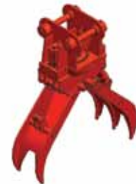
Model 60 Mor-bite™ Grapple

Base length. . . . . 5'11.625" Base width (11 tine) . . . . . 82" Base width (13 tine) . . . . . 102" Weight (11 tine) . . . . . 3,500 lbs. (less mounts) Weight (13 tine) . . . . . 4,000 lbs. (less mounts) Hinge pins . . . . . 2" diameter chrome Maximum clamp opening . . . . . 6'5.25"